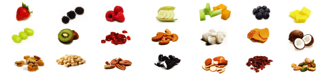
Toppings subject to seasonality

Yogurt topping prices: $1.25 for 1st topping & $0.50 for each additional